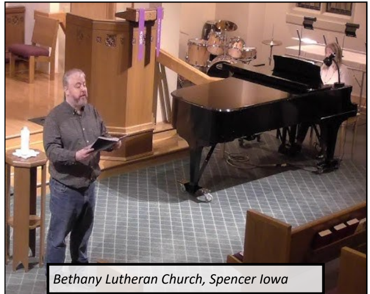
Bethany Lutheran Church, Spencer Iowa