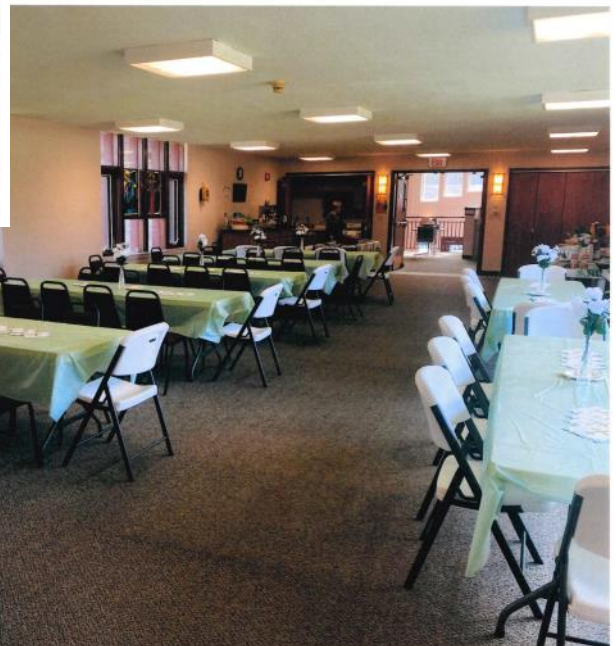
The Tables Were Set!