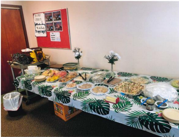
What a Spread!