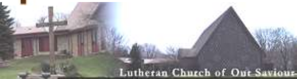
Lutheran Church of Our Saviour

Join your friends and neighbors at the Lutheran Church of Our Saviour as we celebrate God's Love for all people and work faithfully to carry out God's Purpose in this world.